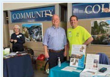
Bucks County Kehillah hosted the Bucks County Jewish Festival 2022 at Bucks County Community College.

I stopped by Pennsbury High School West to share my appreciation for the hard work of their faculty and staff during Teacher Appreciation Week.