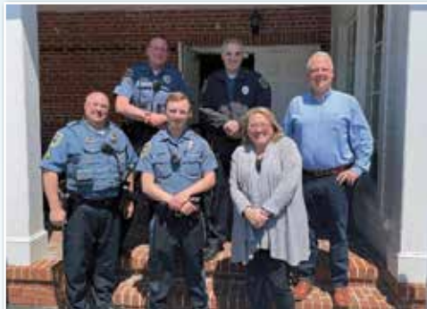
National Prescription Drug Takeback Day with Newtown Borough Police