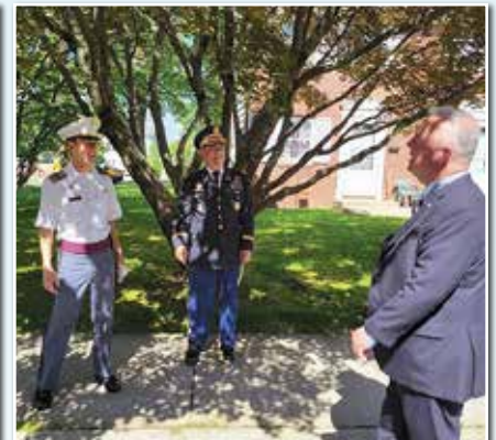
Memorial Day parades in Newtown and Yardley